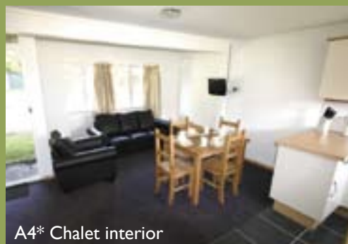
A4* Chalet interior

A4* Chalets (shown in main image). Chalets are all timber clad except for A6. A6, A5*, A4* & A5 have pitched roofs. All other chalets have flat roofs.