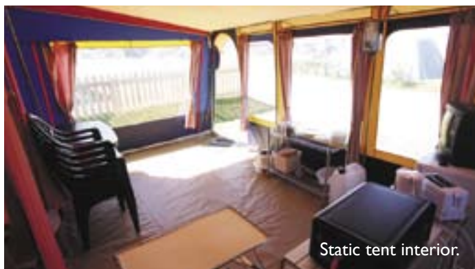
Static tent interior.