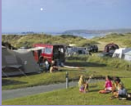
Exterior of static tents.