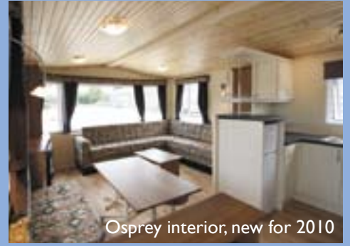
Osprey interior, new for 2010