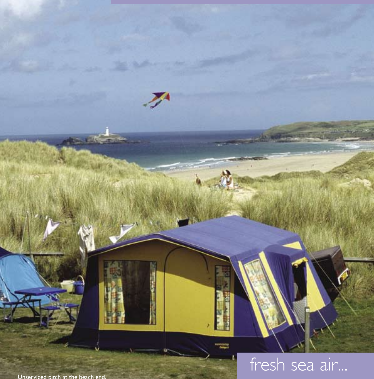
Unserviced pitch at the beach end.